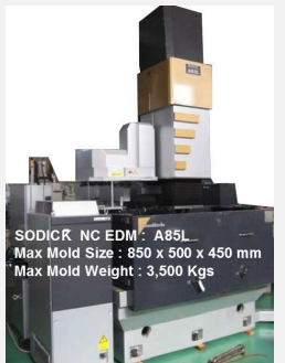
SODICK NC EDM - A85L Max Mold Size : 850 x 500 x 450 mm Max Mold Weight : 3,500 Kgs