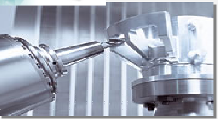
DMU 80P DUO BLOCK