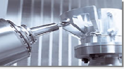
DMU 80P DUO BLOCK