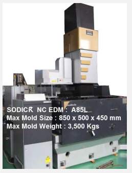
SODICK NC EDM - A85L Max Mold Size : 850 x 500 x 450 mm Max Mold Weight : 3,500 Kgs